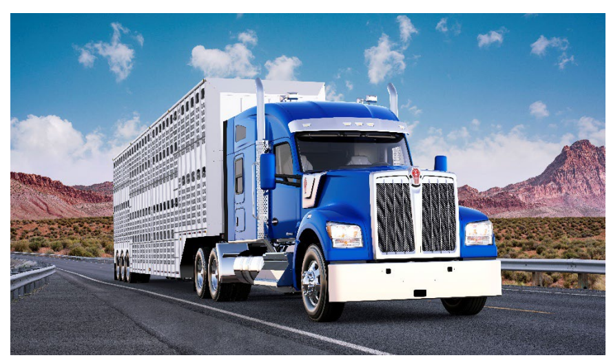
Kenworth W990 Truck

PACCAR achieved quarterly revenues of $6.12 billion in the fourth quarter 2019, compared to the $6.28 billion reported in the same period in 2018. The company earned $531.3 million ($1.53 per diluted share) in the fourth quarter of 2019. PACCAR earned $578.1 million ($1.65 per diluted share) in the fourth quarter of 2018. PACCAR achieved record revenues of $25.60 billion in 2019, a 9% increase compared to revenues of $23.50 billion in 2018. The company earned a record $2.39 billion ($6.87 per diluted share) in 2019, 9% higher than the $2.20 billion ($6.24 per diluted share) earned in 2018.