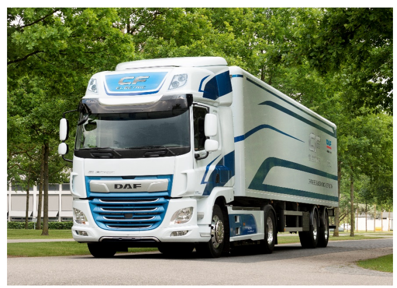
DAF CF Electric Truck

Logistics Solution 2019 in Germany, a prestigious award for the deployment of sustainable technologies in Europe.