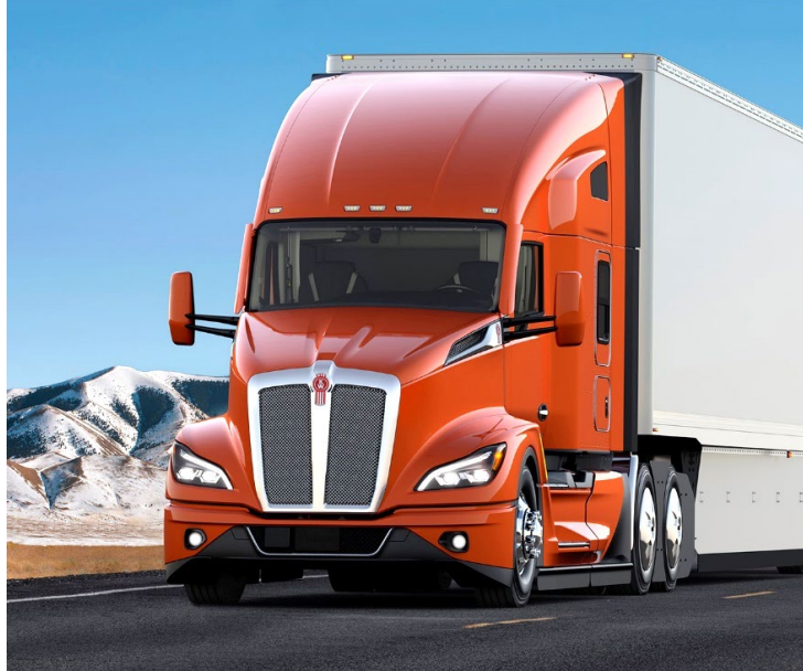
Next Generation Kenworth T680