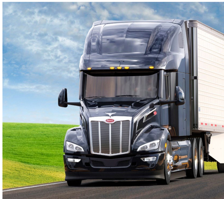
Next Generation Peterbilt 579

“U.S. economic growth in 2021 resulted in good freight tonnage and robust demand for Kenworth and Peterbilt trucks. Class 8 truck industry retail sales in the U.S. and Canada were 250,000 units in 2021. Kenworth and Peterbilt achieved market share of 29.2%,” said Darrin Siver, PACCAR senior vice president. “The new Kenworth T680 and Peterbilt 579 vehicles provide customers with up to 7% increased fuel efficiency, which enhances their operating performance and benefits the environment.” U.S. and Canada Class 8 truck industry retail sales are estimated to be in a range of 250,000-290,000 trucks in 2022, based on good economic growth and strong freight demand.